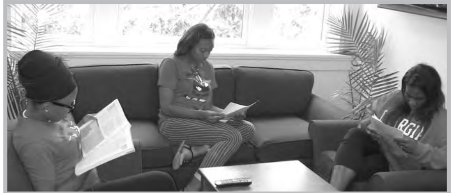
The new Multicultural Services and Programs facilities feature nooks for small gatherings and an office for each of its 13 student organizations.

She received a $20,000 Boren Scholarship to study and research in Addis Ababa, Ethiopia, where she participated in intensive language training, interned at a leading economic policy think tank and served as a teaching assistant. On campus, she is active in the Georgia Political Review , Student Government Association and Habitat for Humanity. To read her complete profile in Amazing Students , see http://t.uga.edu/mU .